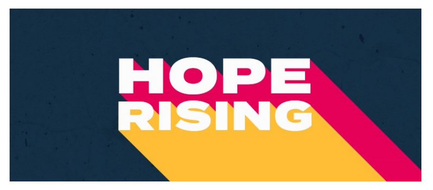
Hope Makes a Victim a Victor May 8-9, 2021