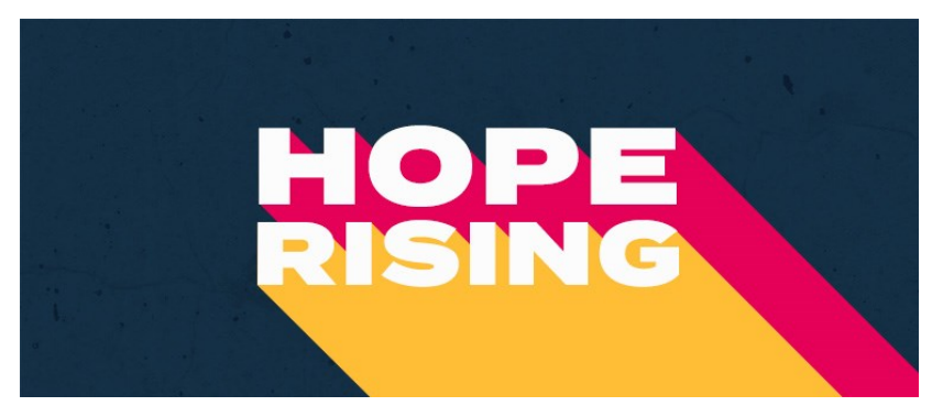
Hope Makes a Victim a Victor May 8-9, 2021